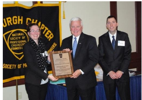
Photos from last year's banquet